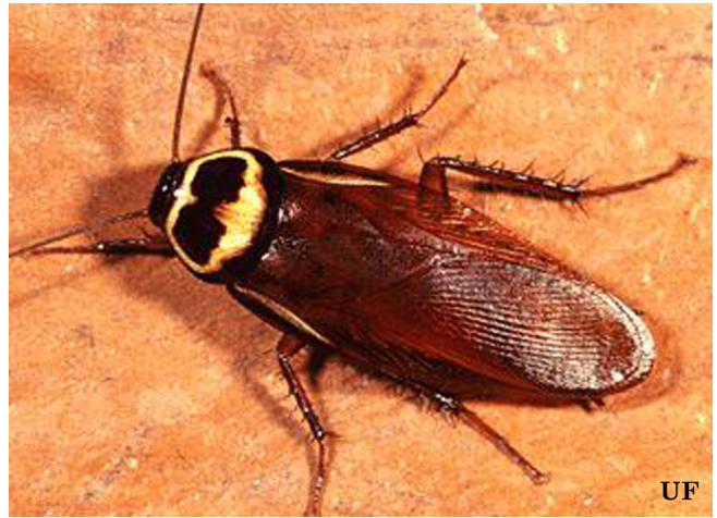
Figure 4. Australian cockroach (actual size 1 1/2").