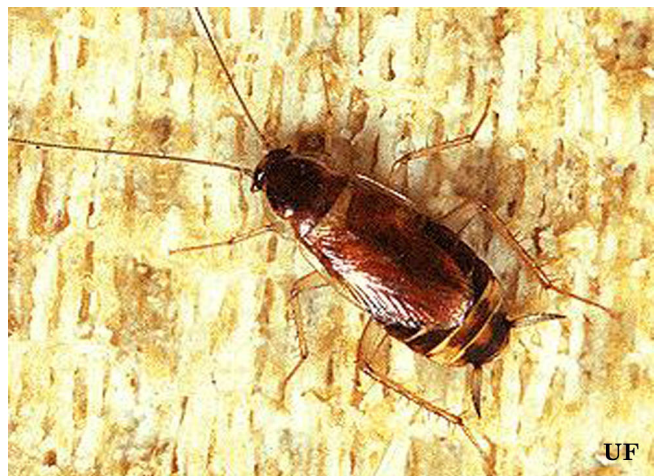
Figure 6. Brownbanded cockroach (actual size, 3/4").

surface by the female as soon as it is formed; however, the female German cockroach carries the