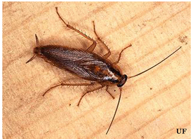
Figure 5. German cockroach (actual size 5/8").