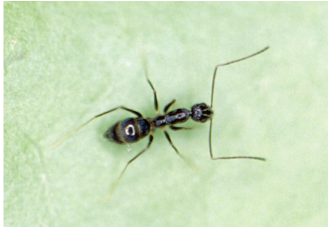
Figure 7. Crazy ant.

back to the nest. Some ants leave scent trails that others can follow to the food source. Ants require water and will travel some distance for it if necessary. Workers are able to bring water to the colony in their stomachs.