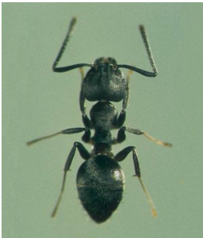
Figure 9. White-footed ant.

The white-footed ant (Figure 9) is a relatively small (< 3 mm in length), black to brownish ant with yellowish tibia and tarsi (feet) and a one-segmented waist. At first glance, it looks similar to the Argentine ant. However, when the white-footed ant is placed on a sheet of black paper, the tarsi (feet) appear whitish in color.