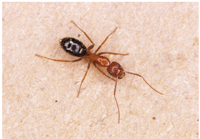
Figure 8. Florida carpenter ant.

These ants are large insects about 1/4 to 1/2 inch long with reddish-brown thorax and dark brown to black abdomen. They usually nest outdoors in stumps and logs where the wood contacts the soil and moisture is plentiful, but sometimes enter homes in search of food, water or nesting sites. Carpenter ants (Figure 8) prefer to nest in wood that has been damaged by termites or decay. These ants do not eat wood (as is the case with termites) but excavate galleries in it to rear their young. They feed on honeydew from sucking insects and household food scraps and do not damage sound wood to any extent. They eject the wood in the form of a coarse sawdust. Carpenter ant galleries are kept smooth and clean and have a sandpapered appearance. Other wood infesting insects do not keep their galleries clean.