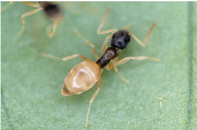
Figure 5. Ghost ant.