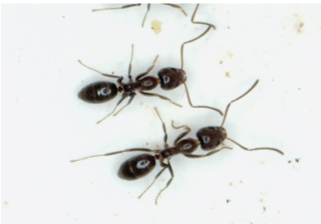
Figure 6. Argentine ant.

back to the nest. Some ants leave scent trails that others can follow to the food source. Ants require water and will travel some distance for it if necessary. Workers are able to bring water to the colony in their stomachs.