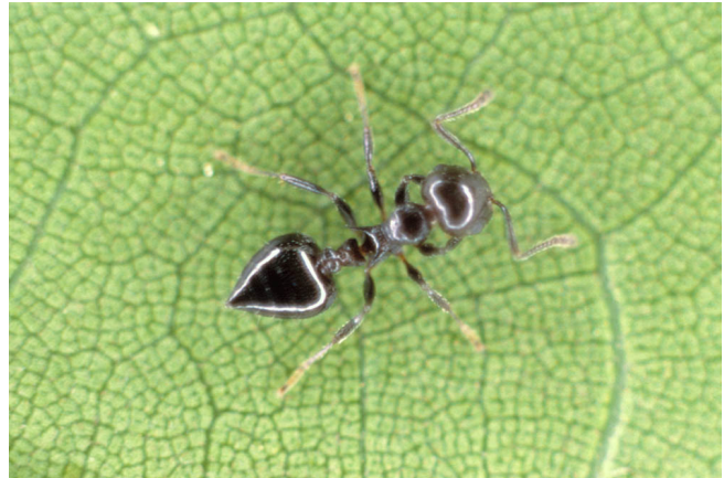
Figure 1. Acrobat ant.

Ants can be recognized from other insects because they have a narrow waist with one or two joints (nodes) between the thorax and abdomen. Also, ants have elbowed antennae. Winged