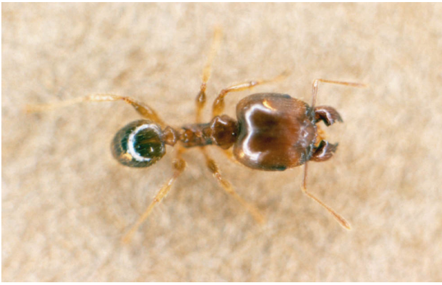
Figure 2. Big-headed ant.