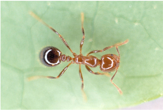
Figure 4. Imported fire ant.